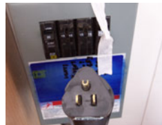
Interior plug for breaker box