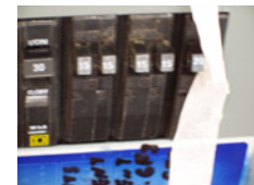
Breaker box for all interior lighting

PLEASE DO NOT LEAVE BREAKER SWITCH (left 2 breakers) TO REMAIN ON IF YOU ARE NOT FULLY HOOKED UP TO WATER—THIS WILL BURN OUT THE HOT WATER HEATER