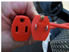
Your power source to the trailer

1, 100 ft. extension cord provided, 110 connection with 25 or 30 amp breaker